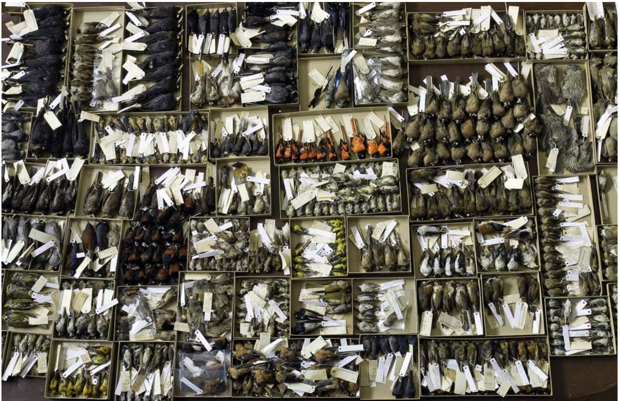
Figure 2. Sample of the bird collection of E. Schäfer from Tibet and Sikkim in the Museum für Naturkunde Berlin (C. Radke, Museum für Naturkunde Berlin).